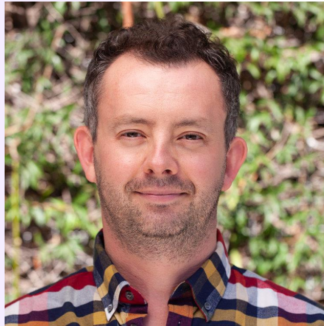
Head of Television Bad Robot Productions