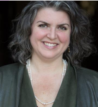
Liz Craft & Sarah Fain THE FIX THE 100